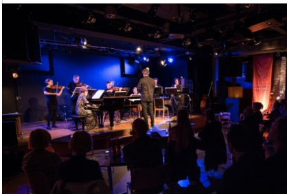
Gislinge and Trondheim Sinfonietta.

Anyhow, in the untitled first movement we hear that throbbing first on piano, later spreading through the ensemble, washing up like little waves. It feels like the most organic of impulses – not least as it's so clear, in a sonic sense – but perhaps does so because it's scored to emerge and recede fluidly yet obviously. In the third movement 'Andante' a fertile, retrospective four-note gesture initiated by the oboe comes to shape everything that happens but in a rather less clear way; it ends up on the piano, suddenly a great deal more delicate than it was before (typical).