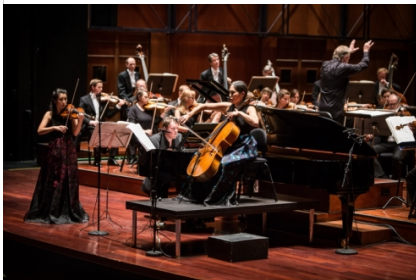
Trio con Brio and Trondheim Symphony Orchestra.

Instead of sinking inexorably into the depths and the dust, Sørensen's music, more and more, is finding clues to a different exit – maybe, even, to new life.